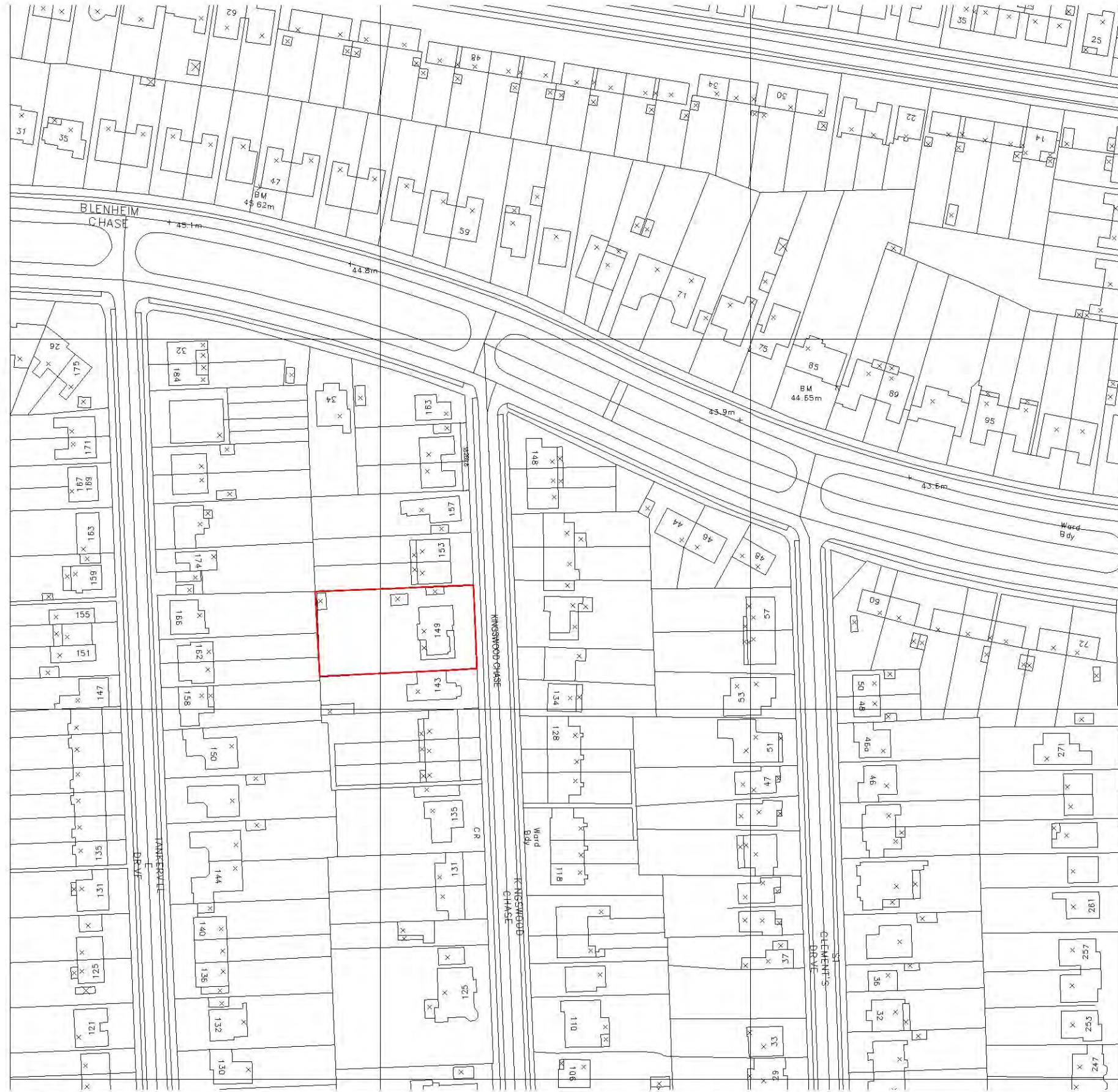
1 Location Plan 1 : 1250